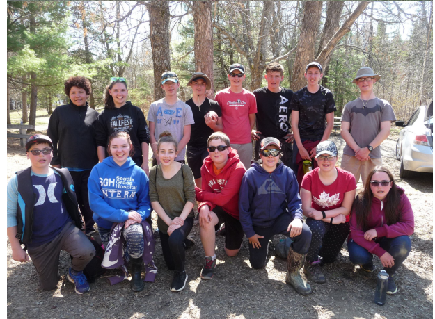
Grade 8 Campers 2018